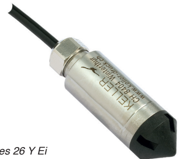
Series 26 Y Ei