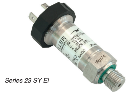
Series 23 SY Ei