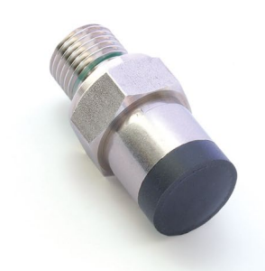
Series 21 D RFID RFID pressure transponder (passive)