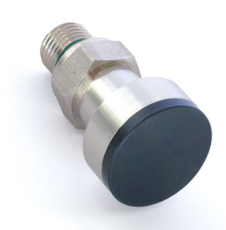
Series 21 DC RFID RFID data logger (battery-operated)